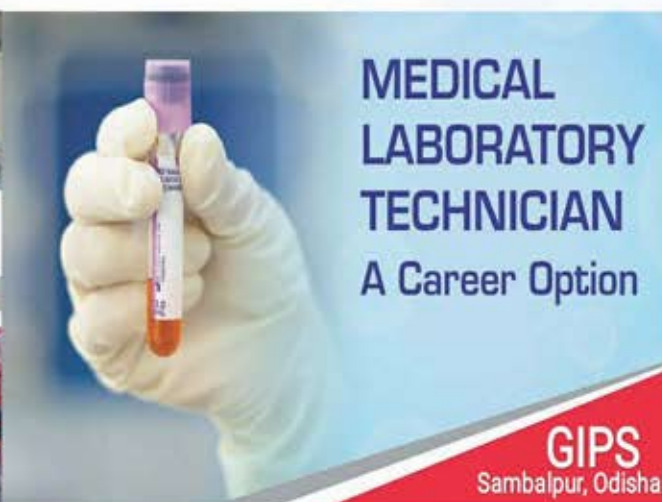
Career Counselling Programme