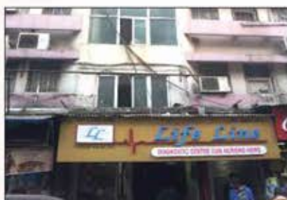
LIFE LINE DIAGNOSTIC