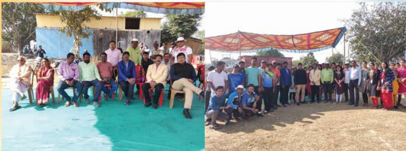
Annual Athletic Meet