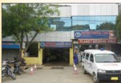
ASTHA NURSING HOME