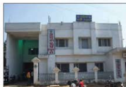
AMRITA NURSING HOME