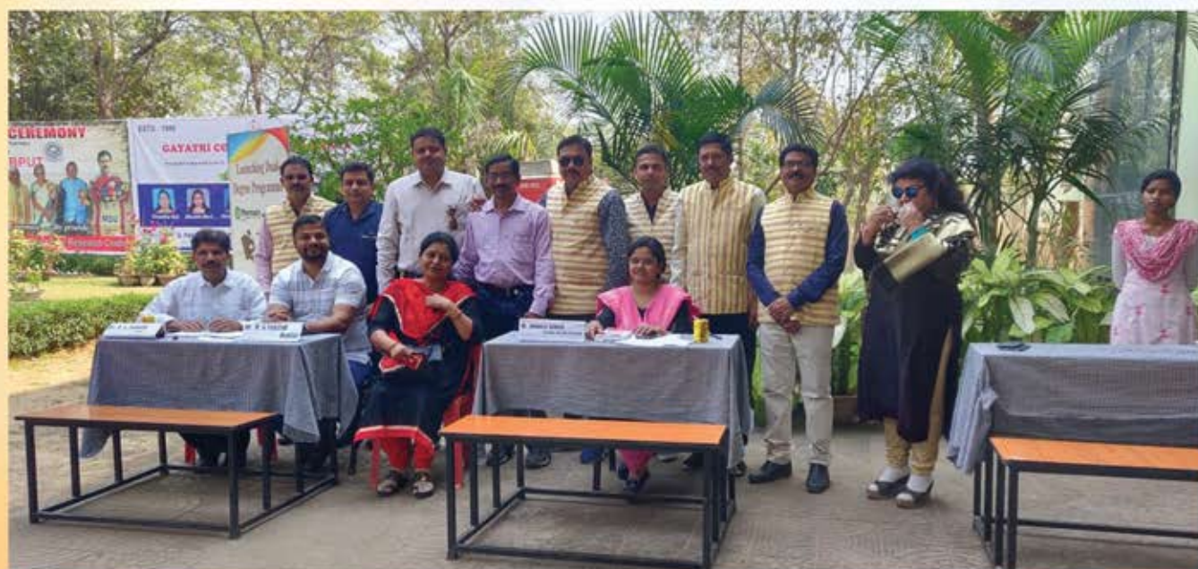
HEALTH AWARENESS PROGRAMME